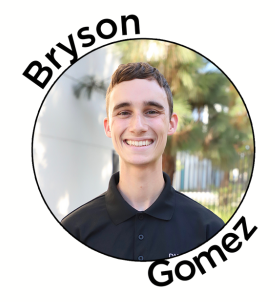
Working as a medical scribe for Stanford Health Care, and performing clinical research as a part of their COMET Fellowship. Also studying for the MCAT in his free time