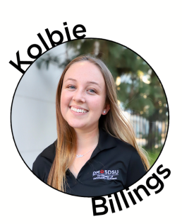
Attending San Diego State University's teaching credential program to eventually be an elementary school teacher