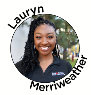
Applying to master's programs in speech language pathology