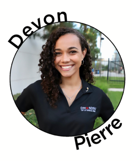
Attending San Diego State University to earn her Doctorate of Physical Therapy